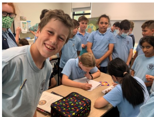
Pearl vs Amy.....very intense!!!

This game is great for at home or while travelling! Have a go!